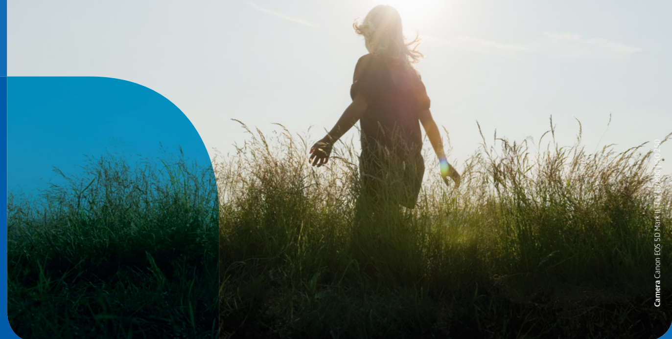
Camera Canon EOS 5D Mark III

It's about people. It's about image. It's about time.